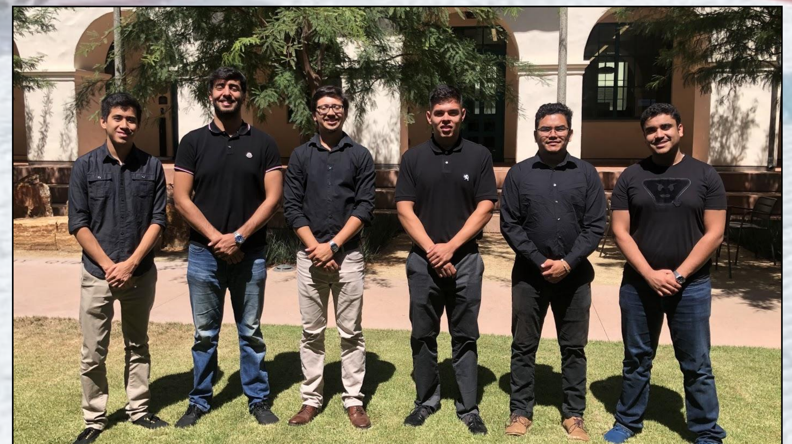
Team Members(Left to Right)